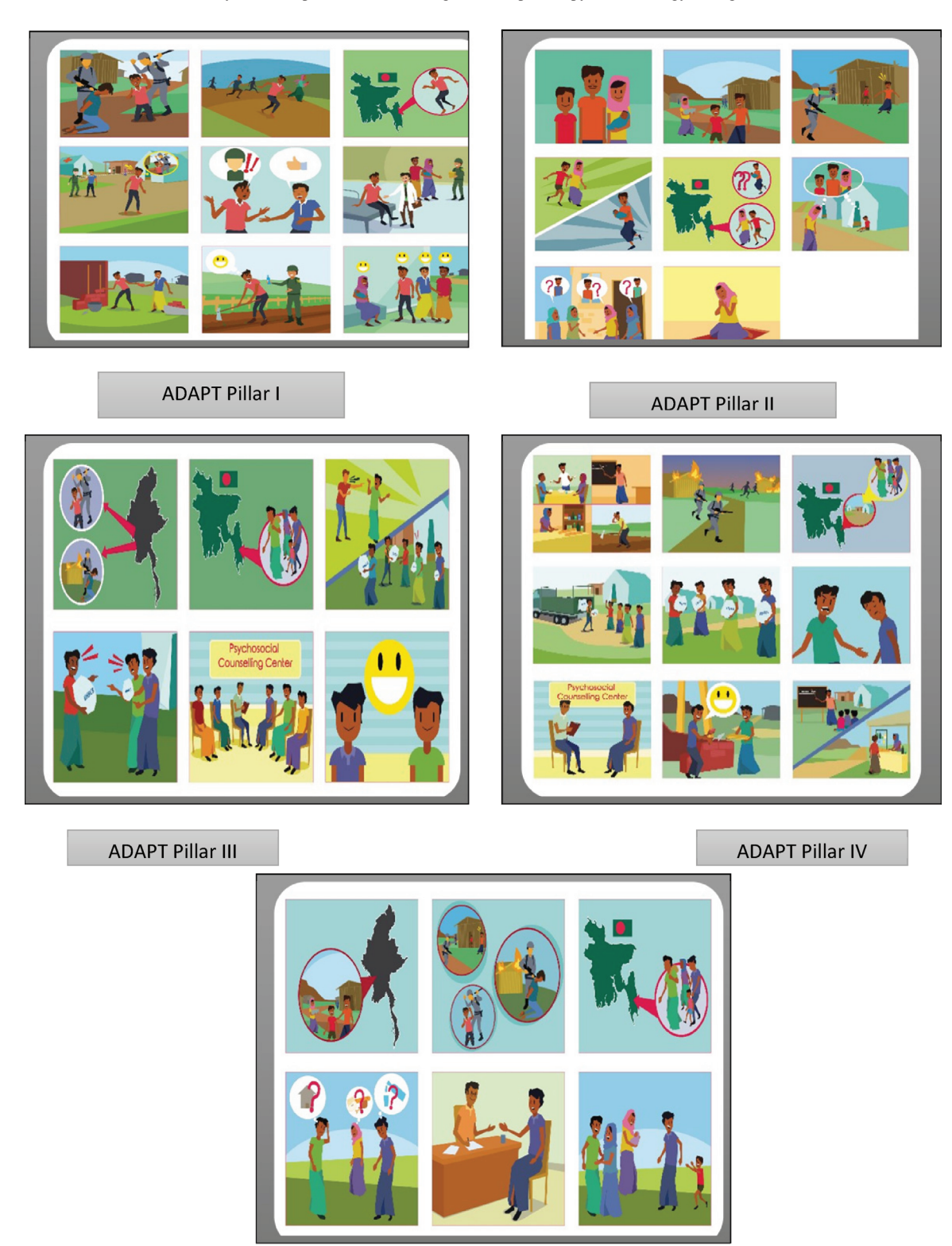
Tay et al.: Implementation of integrative adapt therapy with Rohingya refugees