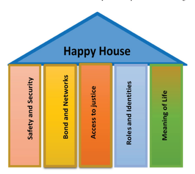
Figure 4: The ADAPT-inspired Happy House for providing psychoeducation in terms of ADAPT pillars

framework. Figures 4 and 5 shows the key psychoeducational tool, the ADAPT-inspired Happy House, used in the IAT programme.